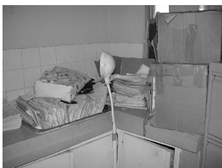
Patient records in a health post (UNAP - primary health care unit) in a batey.

“Everyone knows [the HIV test result] before the patient -- the janitor, other patients, nurses, everyone.”