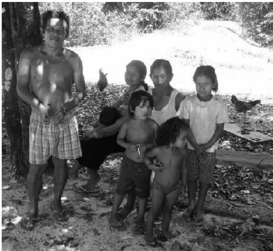
Amerindian family in Guyana.