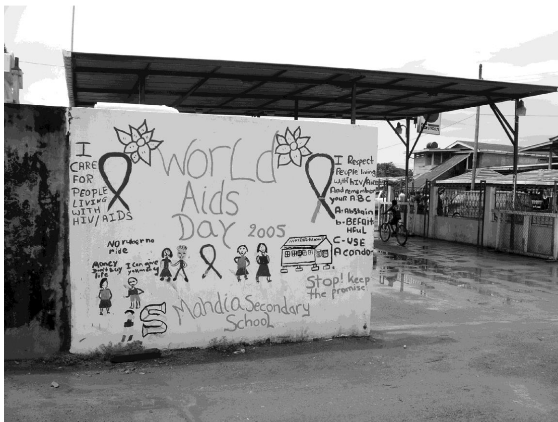
HIV/AIDS Awareness outside a school in Guyana.