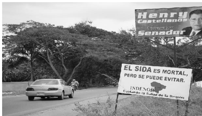
HIV poster on road in Dominican .