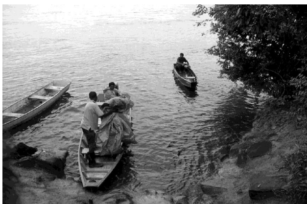
Boat, providing main mode of transport for Micobie community in rural Guyana.

Access to essential medicines varies greatly in Guyana from region to region. In addition to the Amerindians, the majority of the population in the hinterland of Guyana is unable to access medicines, unless they travel to Georgetown or have access to the regional hospitals in Regions Seven or Nine. This often involves long and expensive journeys by foot, boat, road or plane, in a country that has very limited infrastructure linking the interior to the coastal area.