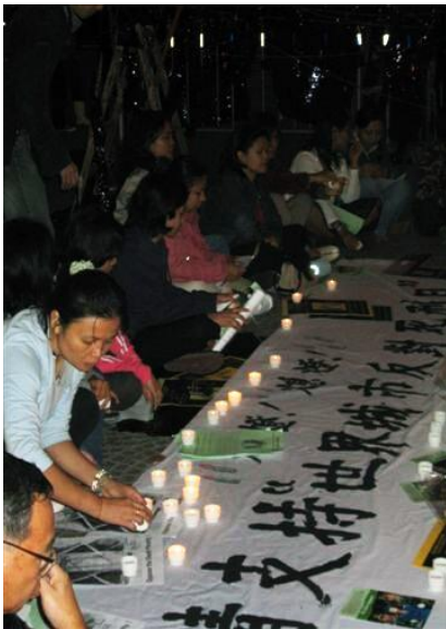
AI Hong Kong's vigil on for the "Cities of Life - Cities Against the Death Penalty" campaign