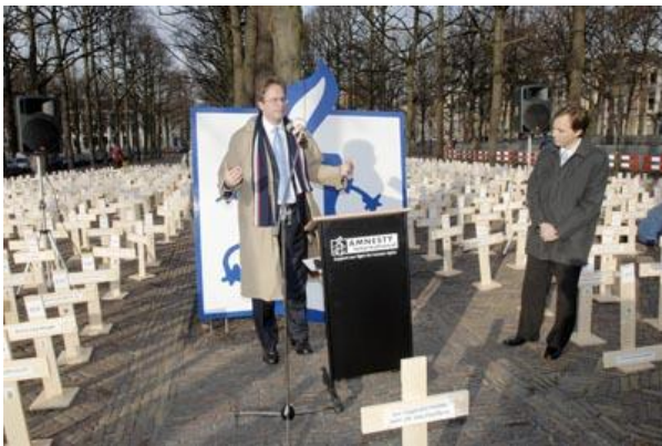
AI Netherlands demonstration in front of the US Embassy at the 1000 th execution in the USA