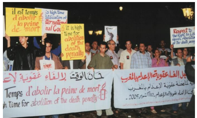
AI Morocco demonstrating, on the World Day with other NGOs, against the death penalty.