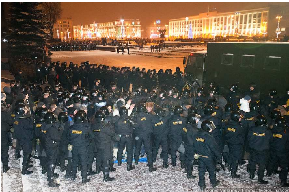
Law enforcement officers forming a corridor and beating demonstrators as they pass through to the police van