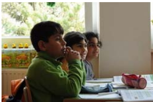
Romani children during class at the Torysa elementary school, Slovakia, April 2010.

The prejudices of education providers and many amongst the non-Roma population still constitute major obstacles to serious reform. As the Director of the Institute for Pedagogic Research in the Czech Republic explained to Amnesty International in February 2009: “We’re a very homogenous society and we’re not prepared to work with those who are different in a way that would enable them to succeed. There are laws about respect for diversity but in practice it’s different.”