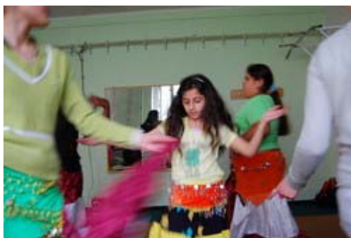
Romani girls rehearsing for the celebration of International Roma Day at a segregated Roma-only school in Ostrava, Czech Republic, 6 April 2009.

A survey of 3,510 Roma in seven European Union (EU) countries carried out by the EU's Fundamental Rights Agency in 2008 revealed that 15 per cent of respondents were illiterate and 31 per cent had received less than six years of formal education.