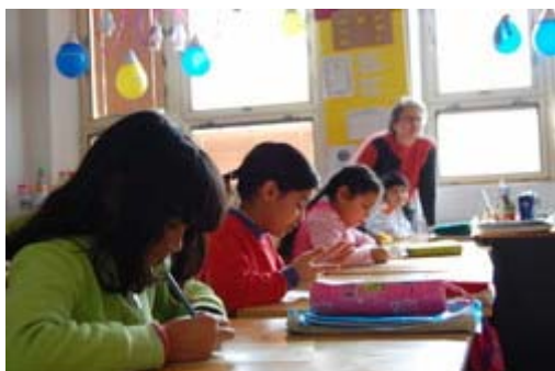
Romani children attending grade 3 of a practical elementary school for pupils with "mild mental disabilities" in Ostrava, Czech Republic, 10 February 2009.

country has an official policy of placing Roma in special schools. They often end up there, however, as a result of flawed assessment criteria, pressure from teachers in mainstream schools and because Romani parents feel that their children will be happier in schools where they will be less exposed to the prejudices of teachers and other pupils or their parents. Once erroneously placed in special schools, however, it is extremely difficult for Roma children to ever reintegrate into mainstream ones. They are condemned to a lifetime of unequal and inferior education.