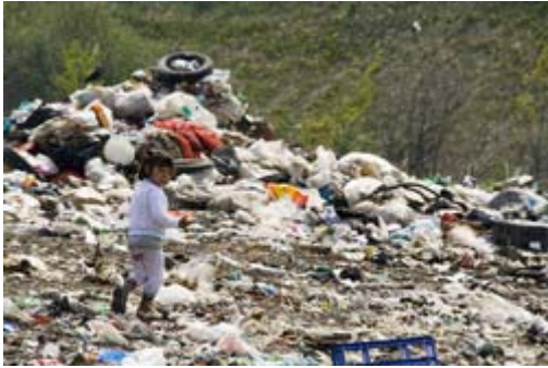
After they were evicted from the centre of Miercurea Ciuc/Csikszereda, some Roma families built shacks next to the town's garbage dump. Miercurea Ciuc/ Csikszereda, Romania, January 2009.

As set out in Article 12 of the International Covenant on Economic, Social and Cultural Rights, the right to health comprises “the right to the enjoyment of the highest attainable standard of physical and mental health”. As the Committee on Economic, Social and Cultural Rights has noted, states are obliged to ensure that “... health facilities, goods and services are accessible to all, especially the most vulnerable or marginalized sections of the population, in law and in fact, without discrimination. ” Across Europe, states are failing to fulfil these obligations.