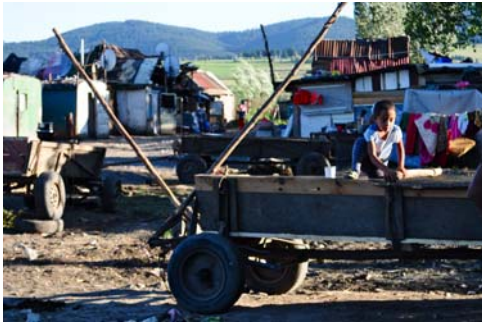
Romani girl playing at the community next to the sewage plant of the town, Miercurea Ciuc, Romania, August 2010.

At no stage were the Romani residents given the opportunity to challenge the eviction decision. They were not consulted before the decision-making process and no other alternatives to the eviction, or to the location of the new settlement, were ever considered or offered. As one member of the community told Amnesty International: “When they came to inform us that we had to move they told us that we were going to be moved to Primaverii Street. [This] was the only option they offered. They said that if we didn't want to go to ... Primaverii Street, then we would have to remain outside on the streets ... because they wouldn't provide another house.”