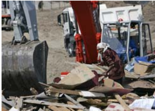
A Roma woman collects parts of her home in front of the Student Games village site, in Belgrade, Serbia, on Friday, April 3, 2009 after makeshift shacks of the Roma community were demolished by the Serbian authorities. Several hundred Roma blocked a street in Belgrade to protest the removal of their makeshift community located near the Student Games village site.

As in many cases of forced evictions, the new accommodation offered to the Roma does not meet the criteria for adequate housing under international law, either in terms of habitability or location, and perpetuates their social exclusion. Though they do now enjoy security of tenure, Roma families with up to five members are living in poorly insulated, damp containers only 14m 2 . The six sites are also all far from the city centre, where many Roma earned their living collecting and re-selling recyclable material, and there are few other employment opportunities nearby.