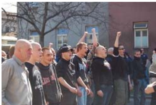
Far right demonstrators at the Roma-populated area in Pířerov in the Czech Republic, 4 April 2009.

seek to close around 200 unauthorized Roma camps on the grounds that they were “the source of illegal trafficking, profoundly degrading living conditions, the exploitation of children for the purposes of begging, prostitution and criminality.”