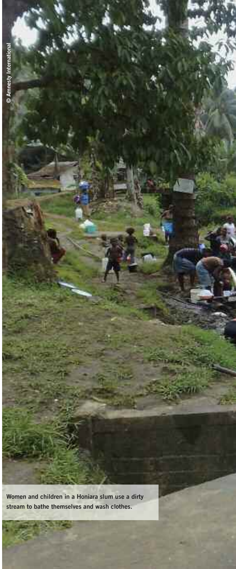
Women and children in a Honiara slum use a dirty stream to bathe themselves and wash clothes.