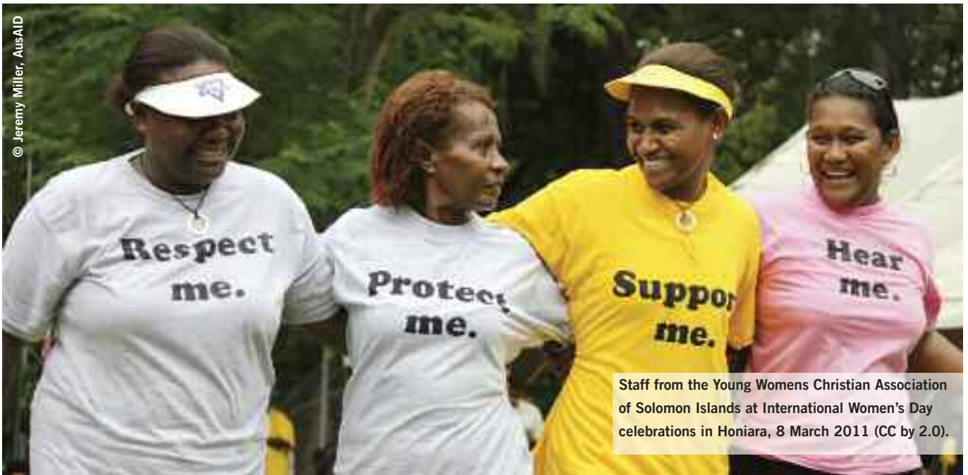
Staff from the Young Womens Christian Association of Solomon Islands at International Women's Day celebrations in Honiara, 8 March 2011 (CC by 2.0).