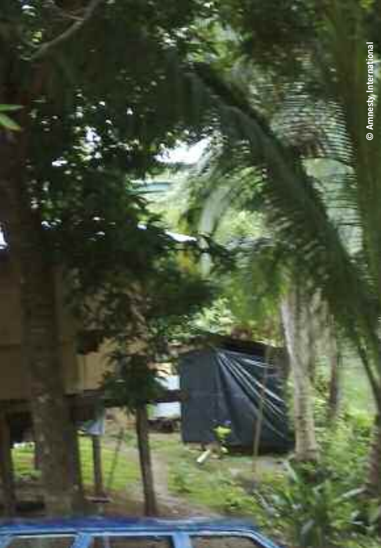
A house built from cardboard boxes is typical of the dwellings found in Honiara’s slums. To the right is a pit toilet with “walls” fashioned from black plastic bags.

“Young men often spy on us and we can hear them laughing and whistling,” said a 29-year-old mother of two. “ Mi les long olgeta [I don’t like it when they do that]. I have no choice because it’s too heavy to carry the water a long way to my home on the ridge!”