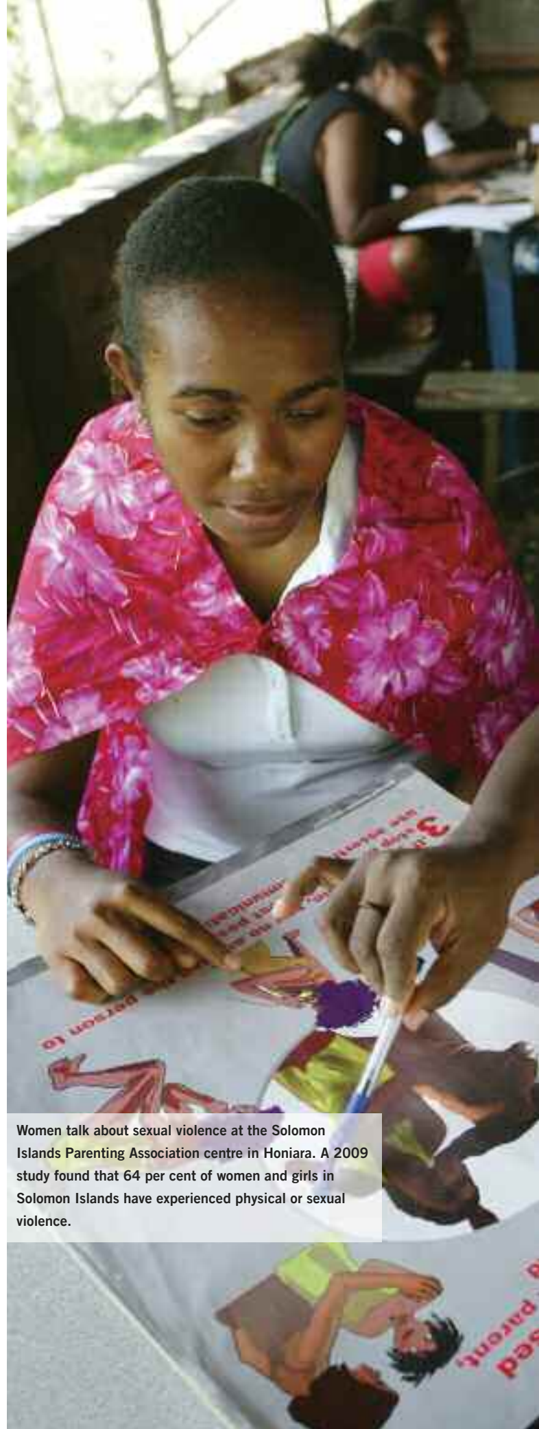
Women talk about sexual violence at the Solomon Islands Parenting Association centre in Honiara. A 2009 study found that 64 per cent of women and girls in Solomon Islands have experienced physical or sexual violence.

Violence against women within the family continues to be seen as a private issue and the police and other officials are often reluctant to intervene. 17 In a number of settlements, including Kobito 1, 2, 3 and 4, the existence of a police post in the area has done little to prevent the harassment and assault of women and girls.