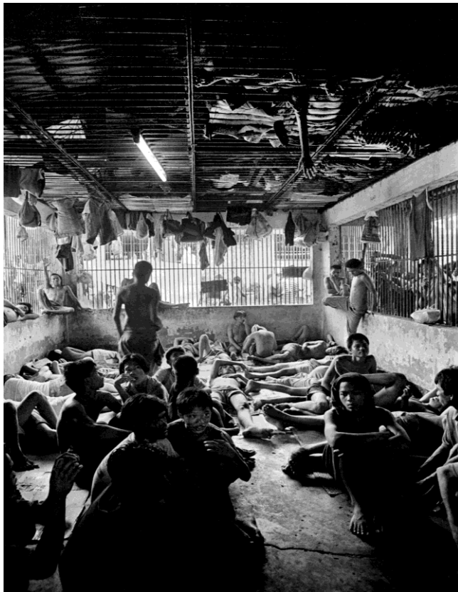
Child and adult detainees confined together in a crowded prison cell in the Visayas.

“In particular, every child deprived of liberty shall be separated from adults unless it is considered in the child's best interest not to do so and shall have the right to maintain contact with his or her family through correspondence and visits, save in exceptional circumstances;” (37( c),CRC)