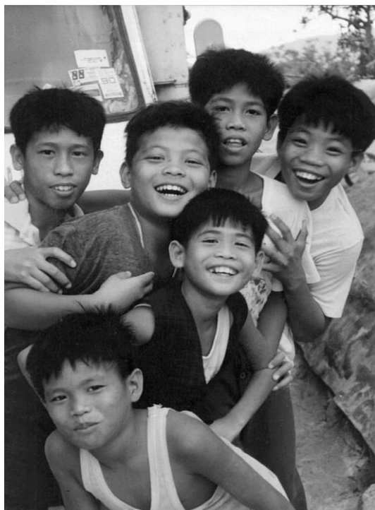
A group of former street children who have been helped by children's NGO PREDA and are now leading successful lives.

“In all actions concerning children, whether undertaken by public or private social welfare institutions, courts of law, administrative authorities or legislative bodies, the best interests of the child shall be a primary consideration.” (Article 3 (1), CRC)