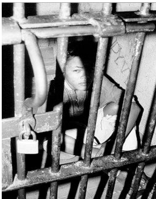
Boy in a detention cell, Southern Philippines.

time of arrest to trial. 45 The law allows for the detention of children in separate quarters of “provincial, city [or] municipal jail” only if there are no appropriate centres or agencies in the area. 46 In practice, children are often detained in prisons despite the existence of local youth facilities, partly because of a number of procedural obstacles.