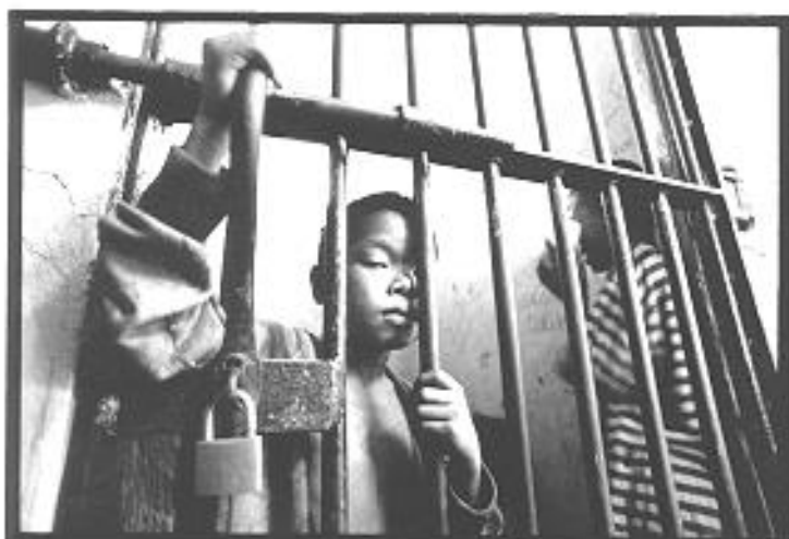
A young boy in detention.

Philippine law operates on the principle that children shall be punished less severely than adults committing the same crimes. This principle is laid out in article 68 of the Revised Penal Code which specifies that offenders between the ages of nine and fifteen (who demonstrate ‘discernment’) shall receive a sentence “two degrees lower” than an adult, and those under eighteen but above fifteen shall receive a sentence of “one degree lower.” By “degree” the law refers to different gradations of severity in the same type of crime. The crime of theft, for example, is divided into several categories based on the value of the goods stolen and consequently, the law provides for differing sentences based on the “degree” of the crime.