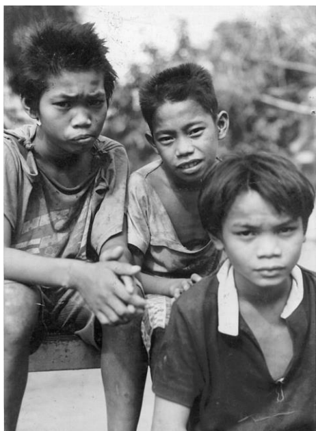
Street children

Even before arrest, children who come into conflict with the law tend to represent the most disadvantaged and marginalized sectors of society. Many are fleeing difficult home situations, often exacerbated by abuse and poverty and resulting in an interrupted education. A nationwide study undertaken by an NGO in the Philippines found that less than a quarter of the child offenders interviewed lived with both parents prior to arrest, and a mere 2.2% of child offenders reported being enrolled in school. 12 Street youth are particularly vulnerable to arrest due to actual or suspected involvement in theft or glue sniffing. Additionally, they are alienated from support structures of family and community. While not all youth in detention come from such disadvantaged sectors, street youth are consistently over-represented in the juvenile justice system. 13 The disadvantages that plague these children outside of detention are accentuated throughout the judicial process as they have a limited understanding of proceedings or their rights and little access to support structures such as family, legal counsel or social workers.