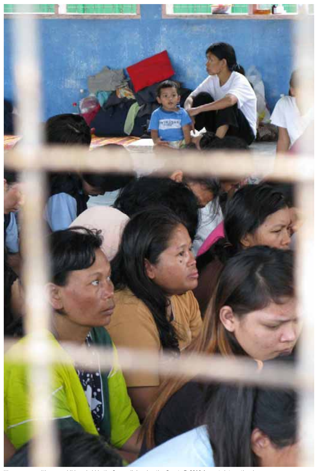
Women, some with young children, held in the Semenyih Immigration Depot.