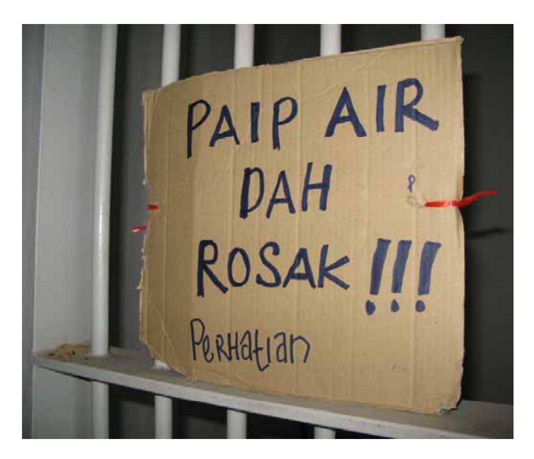
"Water supply disrupted," advised a sign at the entrance to one wing at the Semenyih Immigration Depot.

Overcrowding, poor hygiene and sanitation, and irregular access to treatment mean that serious illnesses can spread quickly. The Malaysian human rights group SUARAM documented at least ten deaths in immigration detention centres in 2009 due to outbreaks of leptospirosis and other diseases. 115