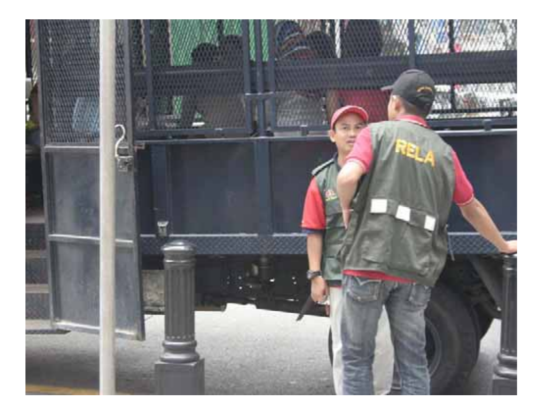
Immigration and RELA agents conduct a round-up in central Kuala Lumpur, July 2009.

Regular police engage in extortion as well, and may threaten or inflict violence on those who cannot pay. Because so many migrant workers suffer such abuses—nearly every worker Amnesty International interviewed had been the victim of police extortion or knew somebody who had been—they are understandably reluctant to report other crime to the authorities. "Some local gangs, they do robbery," said one Nepali worker who was living in the Klang Valley. "They use knives. There is no protection. We cannot fight if they pull a knife because police will take us. They are local. We cannot go to the police station because we are foreigners. We are not stable here."