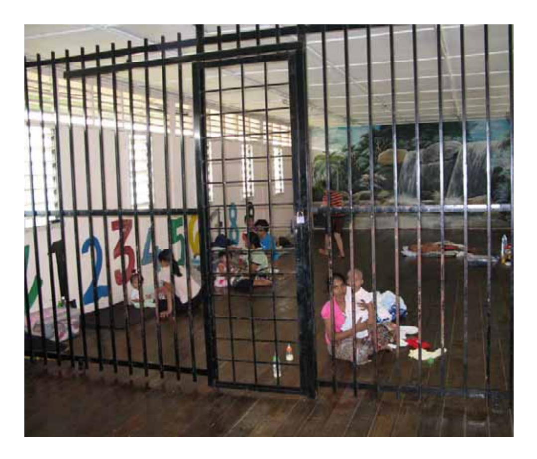
The Lenggeng Immigration Depot has a separate dormitory for women with young children, but it is little more than a large caged-in area.

holding close to 300 detainees. Women are housed in a separate section of the detention centre, with most in a two-story dormitory. Women held along with children under the age of five are housed in a separate dormitory—really a large cage—with no activities for their children.