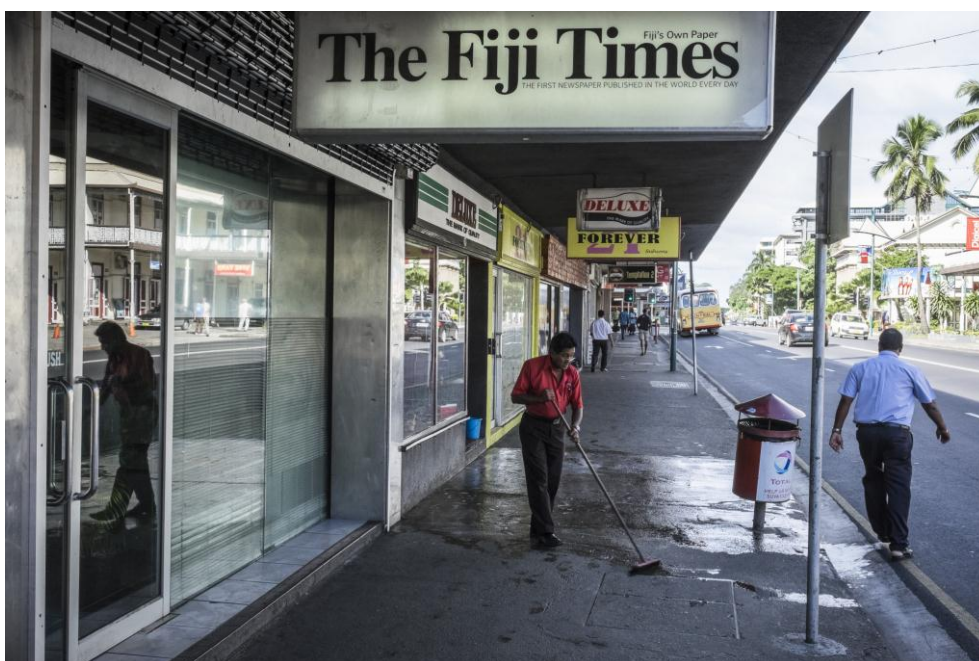
Picture of Fiji Times office, Suva, Fiji. July 2014. A culture of self-censorship has become entrenched in media reporting.

In addition to this, Amnesty International has expressed concern that contempt of court proceedings have been used to stifle the right to freedom of expression, which includes the right to be critical of institutions, such as the judiciary. 16