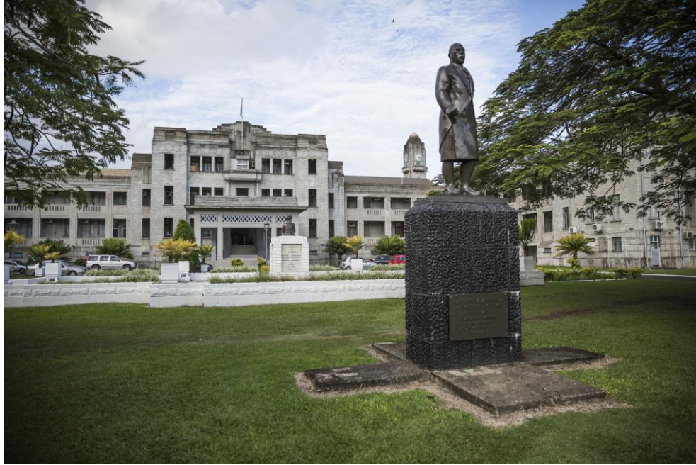
High Court of Fiji, Government Buildings, Suva, Fiji. An independent judiciary is critical to ensuring that victims of human rights violations can seek redress through national courts. July 2014.

Closely linked to the right to a remedy, is the right to a fair hearing before an impartial tribunal. Amnesty International's report Fiji: Paradise Lost, A tale of ongoing human rights violations April-July 2009 , highlighted a number of concerns regarding interference by government with judges and lawyers contrary to international law and standards, including the arbitrary removal of judges, lack of security of tenure and reports of executive interference in the judiciary. Collectively, this undermines the independence of the judiciary. An independent judiciary is critical to ensuring that victims of human rights violations can seek redress through national courts.