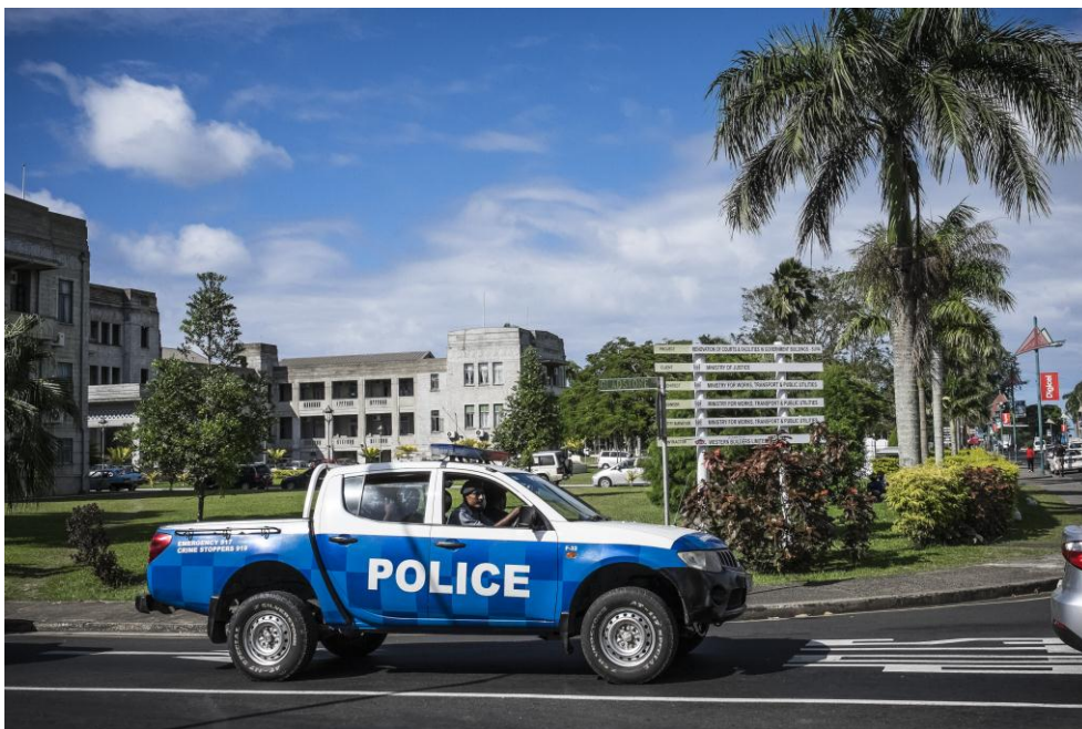
A police vehicle drives past Government Buildings, Suva, Fiji. Police have shown a reluctance to investigate claims of torture against the security forces in the past. July 2013.

There are a number of barriers to people exercising the right to a remedy in Fiji, including the following: