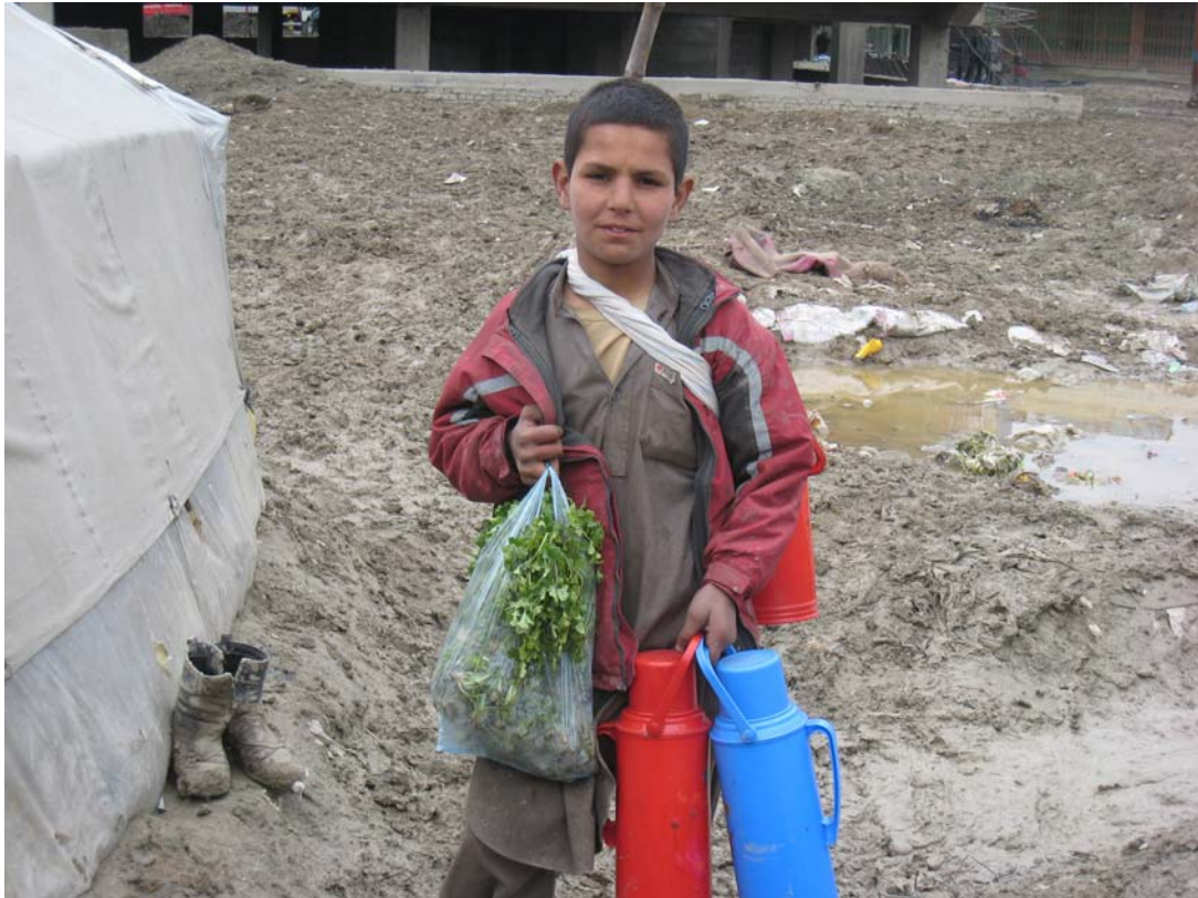
A 12-year-old boy sells tea in the market. He buys whatever food he can afford with the wages he earns each day.