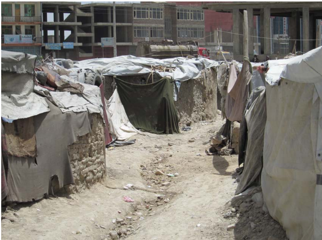
Residents of many informal settlements are at risk of forced eviction so that the land can be developed.

International law requires that evictions comply with appropriate procedural safeguards and afford due process to all affected persons. Evictions must not result in people being rendered homeless or made vulnerable to other human rights violations.