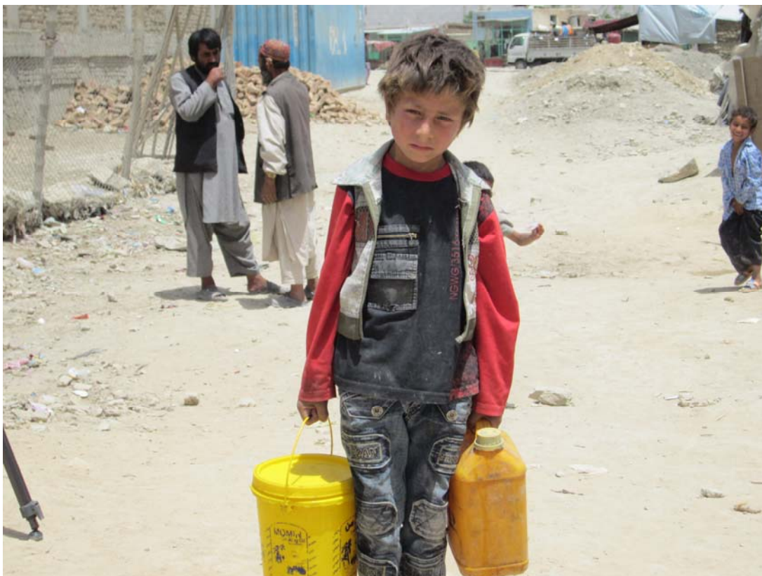
A young boy, about six or seven years old and living in the Chaman-e-Babrak settlement of Kabul, returns home with water on one of half a dozen trips he makes each day.

In addition, as UN-Habitat indicators note, access to safe water requires that households should not have to spend an undue proportion of income or time to acquire it. 101 The World Health Organization has estimated that when water access is basic, requiring a walk of up to one kilometre or within 30 minutes roundtrip, families are unlikely to be able to collect more than 20 litres per person daily, resulting in high public health risk from poor hygiene. When water collection requires a walk of more than one kilometre or more than 30 minutes roundtrip, families are unlikely to be collect more than five litres per person each day, hygiene practice is compromised, and basic consumption needs are not met; the World Health Organization classifies such conditions as “no access” to water. 102 With regard to cost, the UN Committee on Economic, Social and Cultural Rights has noted that “water, and water facilities and services, must be affordable for all. The direct and indirect costs and charges associated with securing water must be affordable and must not compromise or threaten the realization of other Covenant rights.” 103