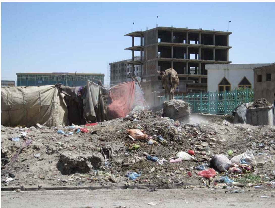
The residents of Kart-e-Parwan, in Kabul, have occupied an abandoned lot that doubles as a garbage dump.