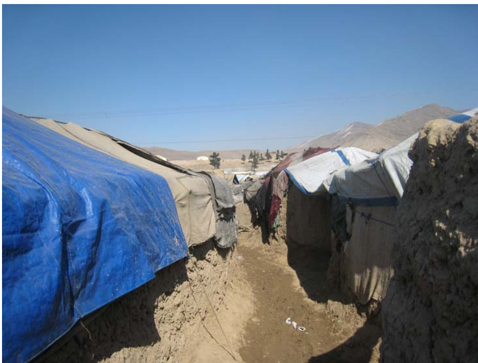
Internally displaced families living in slum areas such as Charahi Qamber, pictured, construct makeshift dwellings on abandoned lots from mud, poles, plastic sheeting, and whatever other materials they can find.

“The trend clearly indicates that displacement is on the rise,” as a 2010 report by the Brookings-Bern Project on Internal Displacement observed. 12 Over 57,000 people were displaced from their homes because of the conflict in the first three months of 2011, an increase of 41 percent over the last quarter of 2010. 13 Looking at the first six months of each year, the increase in displacement was even greater—the total of 91,000 people displaced between January and June 2011 was 46 percent more than the 42,000 displaced in the first half of 2010. 14