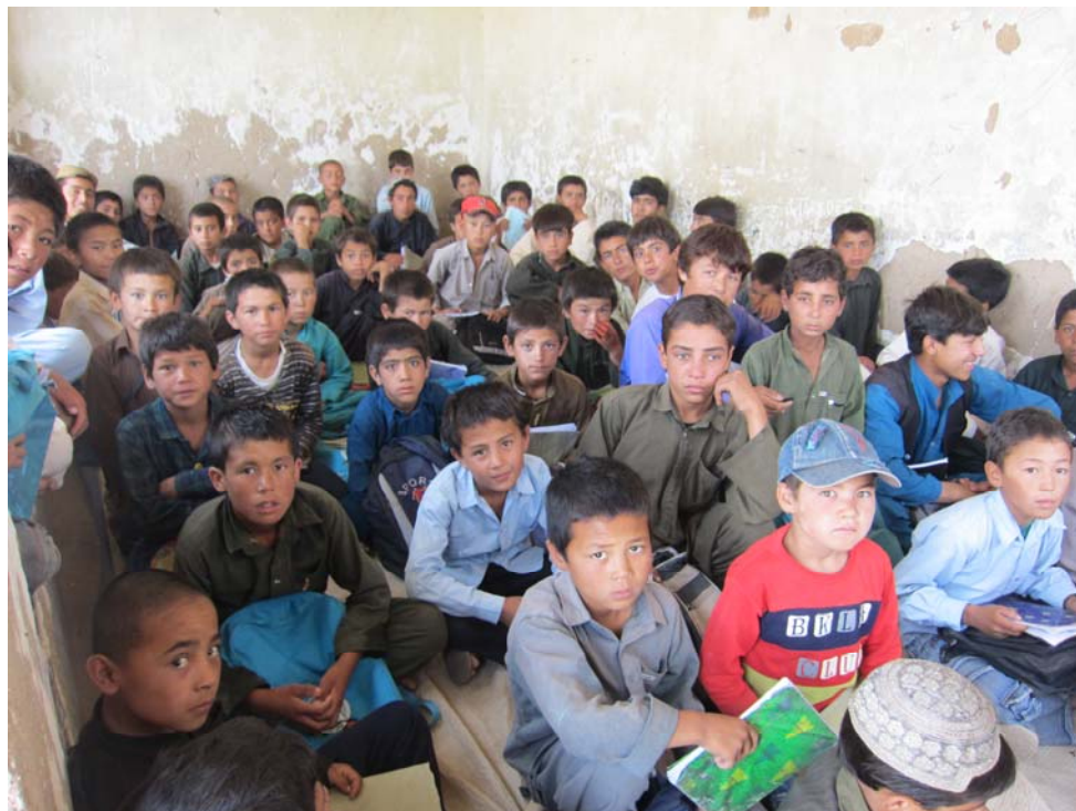
Children crowd into a classroom in Maslakh camp, on the outskirts of Herat.