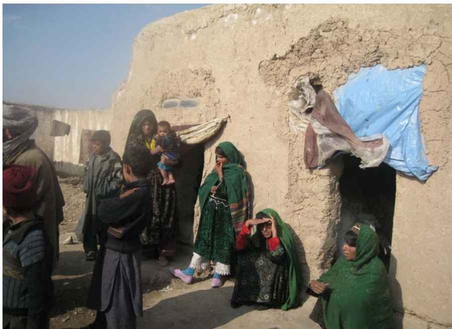
A family displaced from Badghis province has sought refuge in Herat's Maslakh camp.

Those who are displaced internally face periods of displacement that are likely to be longer than they have been in the past and a likely increase in secondary displacement to urban areas. As the Afghanistan Protection Cluster observed for the southern area: