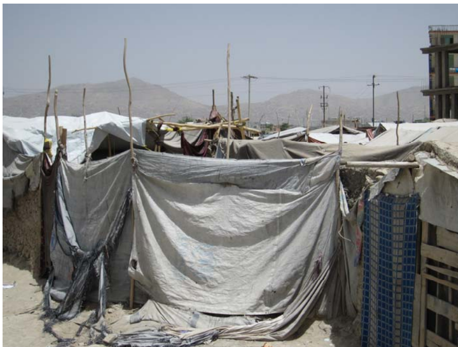
Some shelters are little more than scraps of canvas draped over wooden poles, as with this dwelling in Kart-e-Parwan, Kabul, photographed in June 2011.

As discussed earlier in this chapter, the conflict is a far more immediate and pressing reason for families to uproot themselves, particularly as the fighting spreads and intensifies. And as the rest of this report demonstrates, life in these urban slums is one of unrelenting misery, where even the basic requirements of life are barely met, belying the assumption that people stay there out of choice.