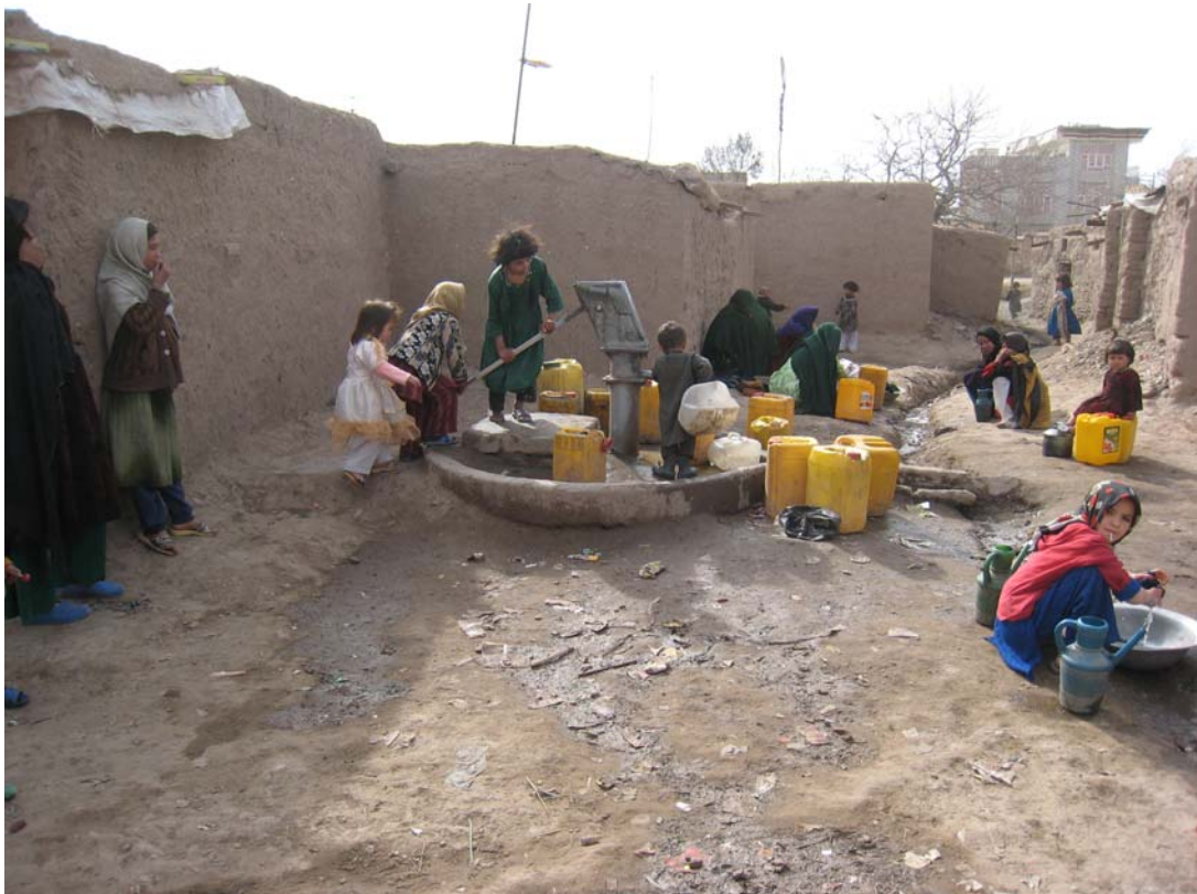
Three girls collect water while other children wait to use the pump in Minarets camp, Herat. Many families in Afghanistan’s informal settlements spend three hours a day or more gathering water; even then, the amount they are able to collect is barely sufficient for survival.