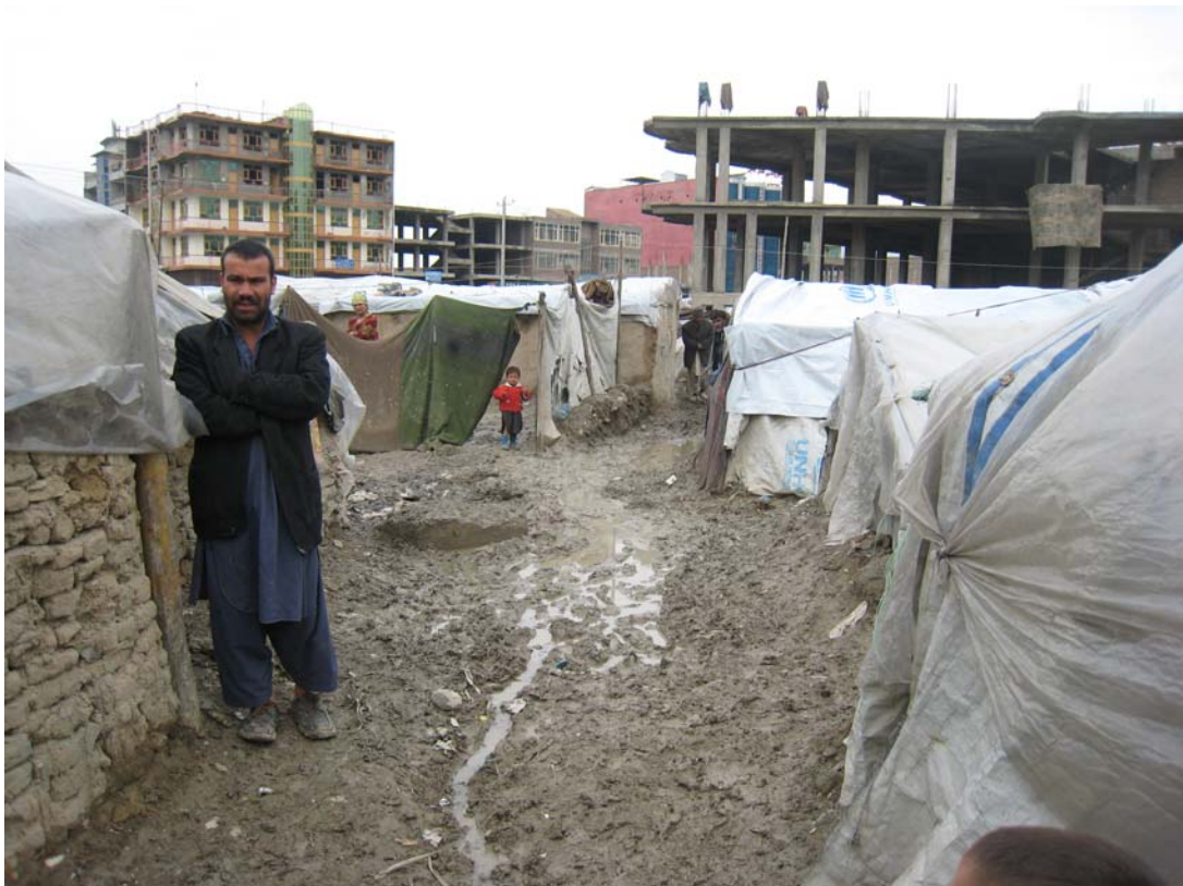
The Chaman-e-Babrak settlement in Kabul. During the winter rains, residents trudge through mud and pools of standing water.

Most dwellings lack adequate sanitation and do not meet other conditions of basic habitability. Many families sleep without bedding, often under torn plastic sheeting that offers only minimal protection from the elements. Without money to buy firewood, they use what they can find for fuel. “Even for making the fire to boil the water, my children have to go collect rubbish. We burn plastic and paper,” one woman, Nurijan, told us.