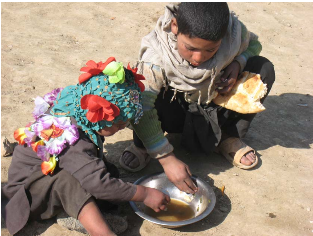
Two children in Charahi Qamber, in the west of Kabul, share a bowl of food provided by a local aid organisation. Many displaced families routinely go hungry.