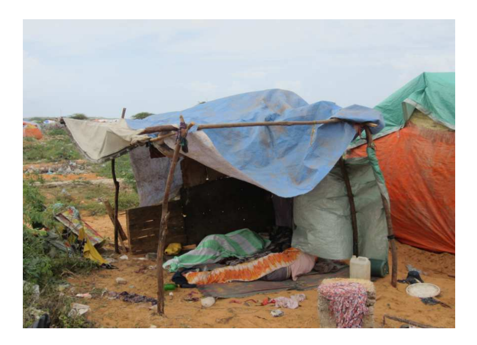
New shelter following eviction

In effect IDPs seem to have been left to find their own solutions. Some IDPs told Amnesty International they are tired of being moved and might be prepared to return to their place of origin, despite the insecurity which prevails there. Such constructive forced returns in which people are left with no real option but to leave would violate Somalia's obligation to protect against forced returns and to ensure that all returns are voluntary and the result of a "free and informed choice."