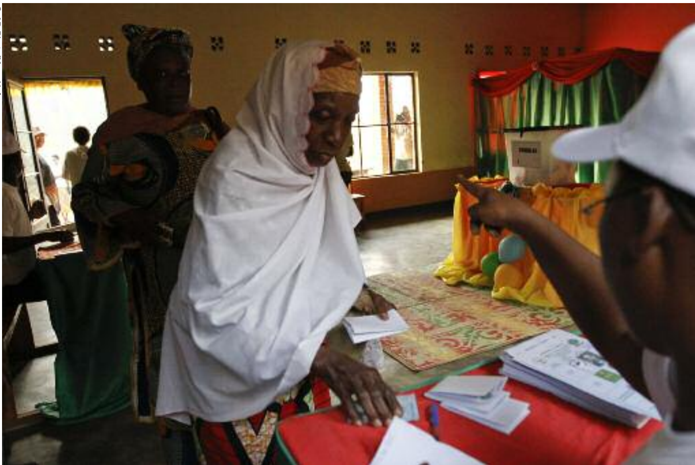
A woman casts her vote at a polling station in Kigali, 9 August 2010.