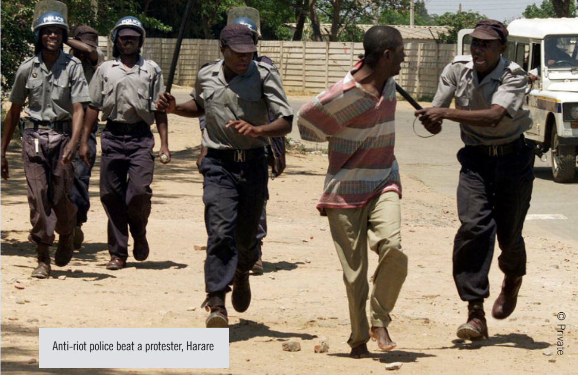
Anti-riot police beat a protester, Harare