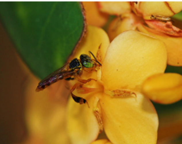
Stingless bee

The vegetation that the bees pollinate not only serves for human use but also feeds the wildlife, and therefore bees are vital insects for the balance and health of the ecosystems. It is impossible to imagine bees without native forests and native forests without bees.