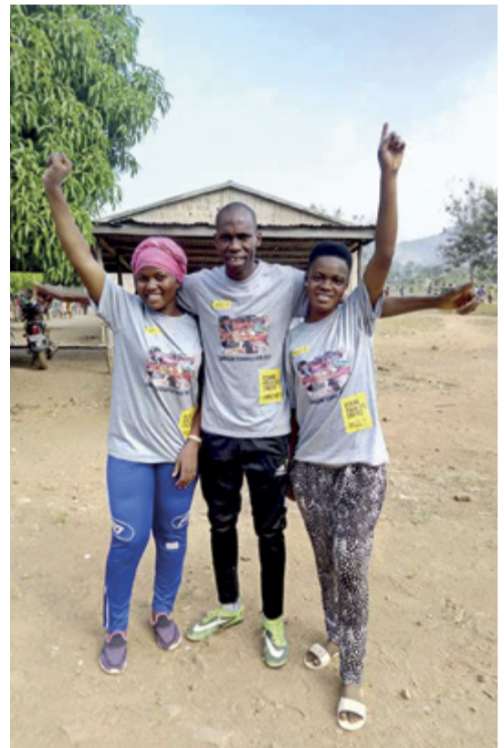
Members of Amnesty International Togo joining in the Write for Rights campaign, 2019. Every year they mobilize people throughout the country to take part.

Human rights are not luxuries that can be met only when practicalities allow.