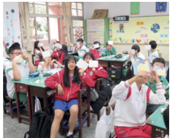
Students and school teachers in Taiwan organized letter writing events with Amnesty International for the Write for Rights campaign 2019.

If you are not familiar with participatory learning methods, look at Amnesty International's Facilitation Manual before you start. This can be found at www.amnesty.org/en/documents/ACT35/020/2011/en/