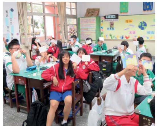
Students and school teachers in Taiwan organized letter writing events with Amnesty International for the Write for Rights campaign 2019.

If you are not familiar with participatory learning methods, look at Amnesty International's Facilitation Manual before you start. This can be found at www.amnesty.org/en/documents/ACT35/020/2011/en/