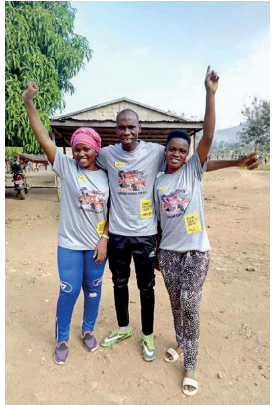
Members of Amnesty International Togo joining in the Write for Rights campaign, 2019. Every year they mobilize people throughout the country to take part.

Human rights are not luxuries that can be met only when practicalities allow.