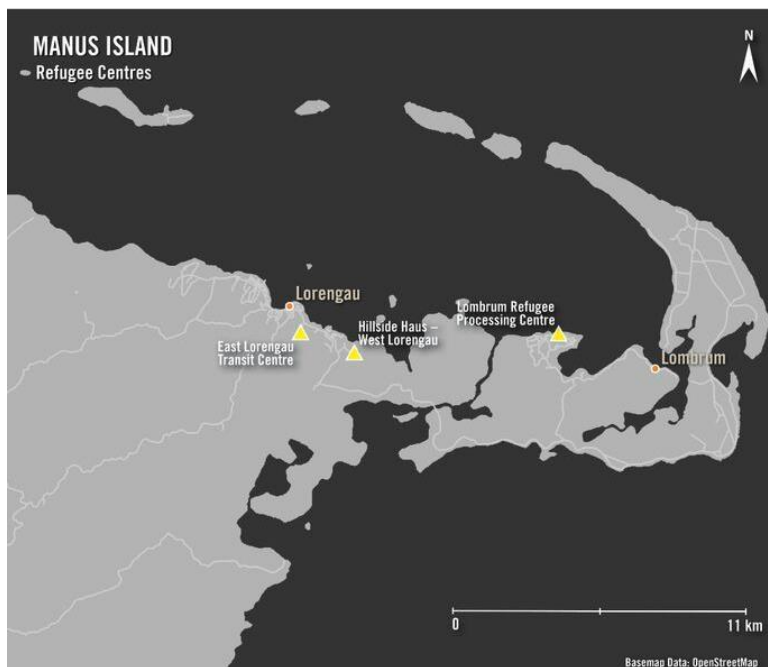
Map showing the location of the refugee detention centres on Manus Island.

After the PNG Supreme Court declared the detention of refugees and asylum seekers unlawful in April 2016, 4 the Australian government announced it would close the original refugee detention centre (known as the RPC on Lombrum Naval Base) on 31 October 2017. The date, nearly 18 months after the court decision, coincided with the end of the contracts with service provider Broadspectrum, who were running the centre on behalf of the Australian government. 5