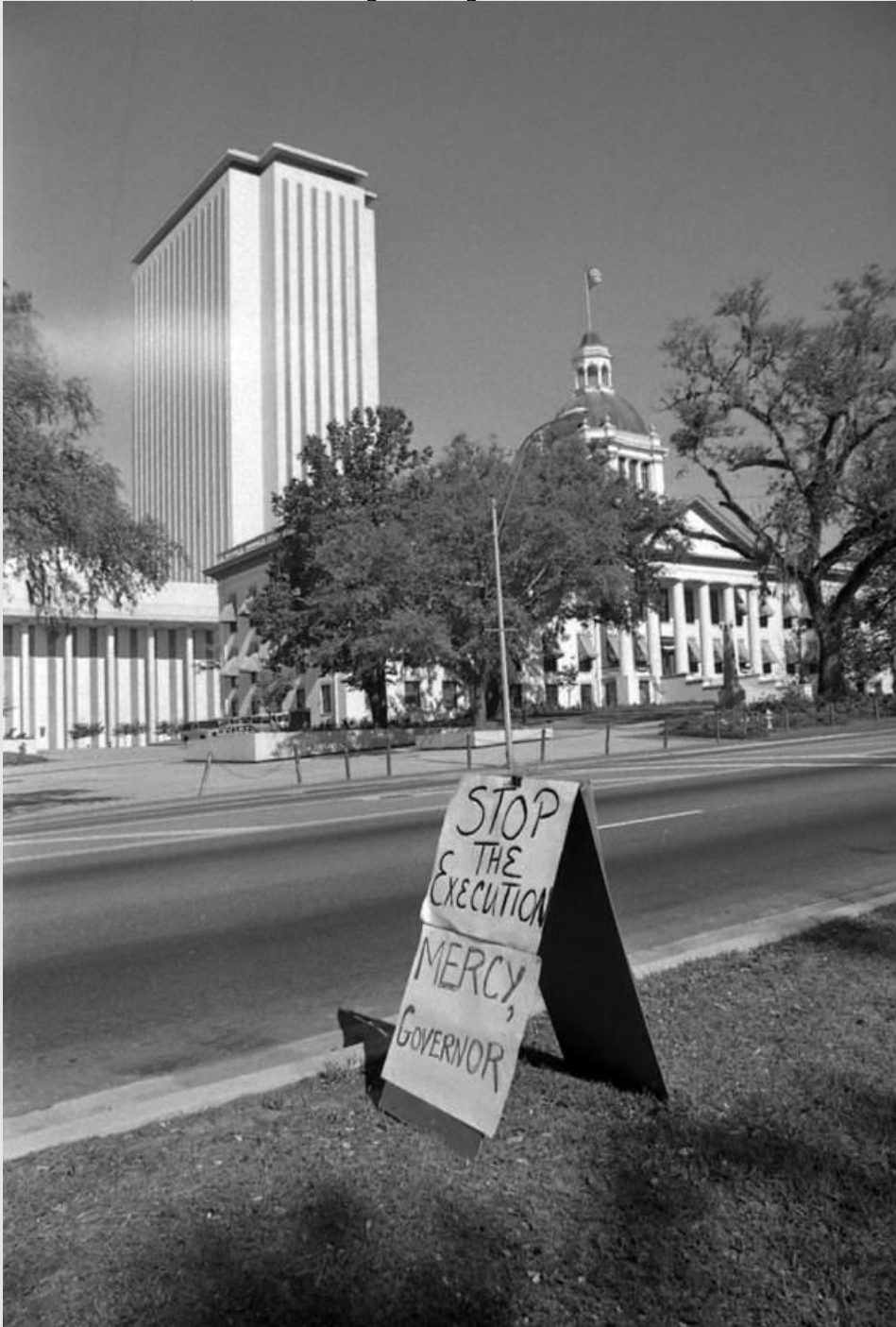
21 April 1986. Execution protest sign - Tallahassee, Florida.

Snapshot: The quality of mercy and Florida are estranged