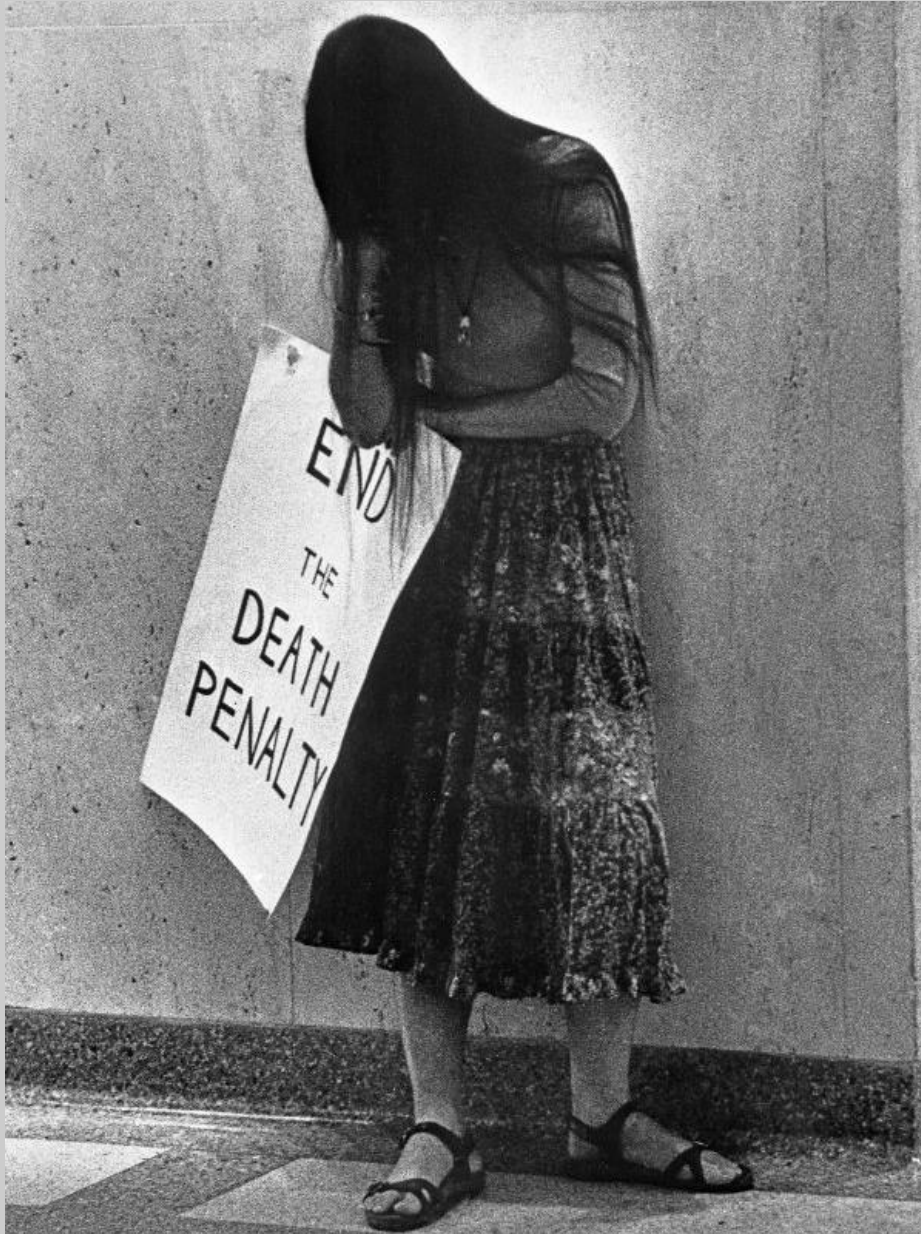
1979. DEATH PENALTY OPPONENT DURING DEMONSTRATIONS AT THE CAPITOL, TALLAHASSEE, FLORIDA.

Working to end the death penalty is a long-term effort, and Florida is a diehard state as far as this cruel punishment is concerned. In the four and a half decades since Florida reinstated the death penalty after the 1972 Furman ruling, country after country has turned against this punishment and today 142 countries are abolitionist in law or practice. In Florida, there have been more than 47,000 reported murders since the state enacted its post- Furman capital statute in December 1972. 200 While “every murder is tragic”, wrote US Supreme Court Justice Stephen Breyer in 2015, “the constitutionality of capital punishment rests on its limited application to the worst of the worst”. Can anyone assert with confidence that those cases in Florida that have resulted in the death penalty were the “worst of the worst” crimes and offenders? Did geography, race, economic class, or other “irrelevant or improper factors” influence this outcome? (see Glossip v. Gross , US Supreme Court, 2015, Justice Breyer dissenting).