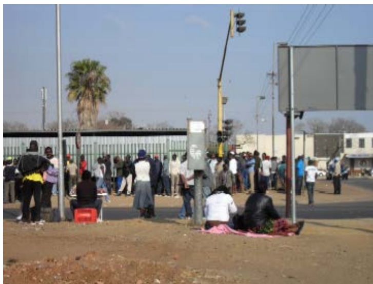
Asylum seekers waiting outside the Refugee Reception Office in Pretoria. Often individuals wait for hours or overnight due to severe problems in accessing the asylum system.