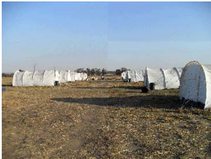
UNHCR tents at Wit Road camp, Johannesburg. © AI, August 2008