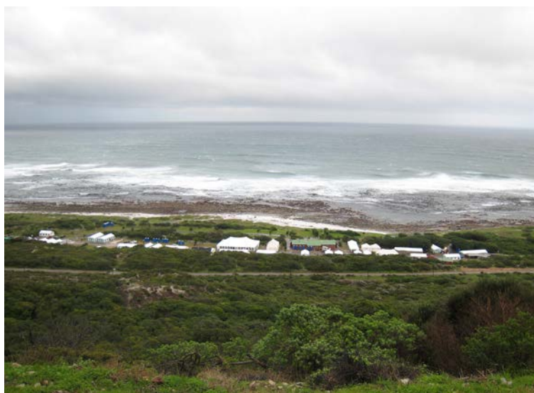
NGOs were particularly concerned by the exposed and isolated conditions of Soetwater camp, Cape Peninsula.

The official safety sites for displaced persons, which were set up after the May violence, provided adequate shelter in most cases and access to essential services. NGOs also played a vital role in the provision of food and other basic assistance as well as psycho-social support. 33 In addition, particularly in the Western Cape, NGOs monitored the conditions in the various camps and pressed for improvements where necessary. 34