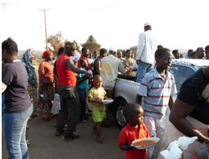
Food being distributed in Akasia camp on 29 August following a period of almost two weeks in which humanitarian organisations were denied access to the camp to provide food assistance.

In the initial period following the setting-up of the camps, residents predominately received three regular meals every day. By August when Amnesty International visited camps in Gauteng province, residents of several camps reported that meals had then been reduced to two and in some cases ceased, or only irregularly provided by virtue of donations from private individuals or charities. In some camps, for example, Wit Road, DBSA and Akasia, milk for infants had stopped being provided around mid-August.