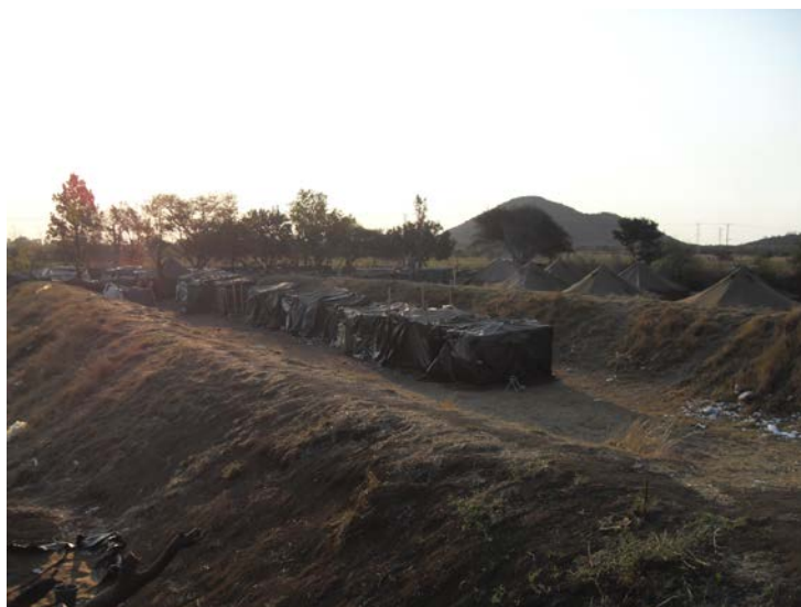
Makeshift tents separated from the rest of the Akasia camp housed Somali asylum seekers and refugees. © AI, August 2008

At Akasia which in early September had about 900 residents, most displaced persons were housed in army-provided tents that appeared adequate. Somali refugees and asylum seekers, however, were housed in a smaller part of the camp, separated from the main camp by a small empty plot of land. They predominantly had makeshift tents, mostly made of plastic sheets and blankets set up on thin pieces of wood. This part of Akasia was in a markedly worse condition than the other, larger part of the camp. Overcrowding in the tents increased after the authorities took down a large tent that was used as both shelter and as a mosque; 40 people who slept in this tent had to relocate to the smaller, overcrowded tents in the camps. Camp residents reported that the authorities had told them that they had to take the tent down as the lease on the tent had expired.