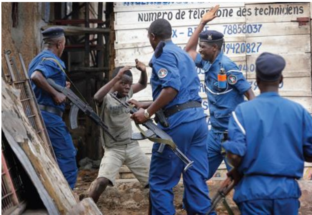
26 May 2015, a young Burundian boy tries to cover himself as police officers beat him during an anti-government demonstration against President Pierre Nkurunziza's bid for a third term in the capital Bujumbura, Burundi.