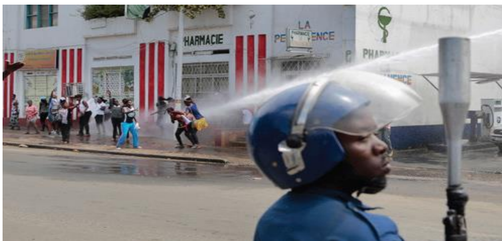
13 May 2015, a police water cannon disperses women demonstrators against President Pierre Nkurunziza's candidacy in the centre of Bujumbura, Burundi.