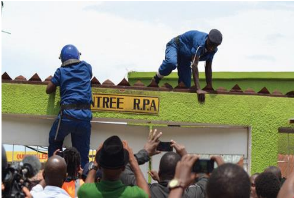
26 April 2015, police officers forcing their entrance into RPA's premises.