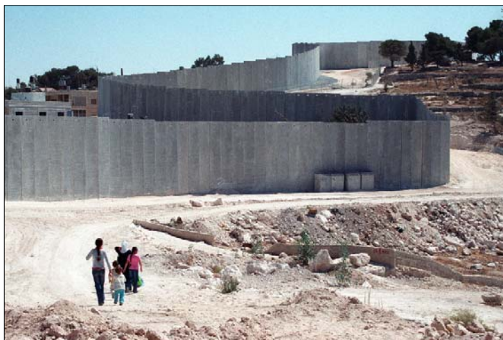
The 700km fence/wall being built by Israel in the occupied West Bank snakes between towns and villages. It is the latest in a series of restrictions placed on Palestinians, barring tens of thousands of them from their land, jobs and essential services.