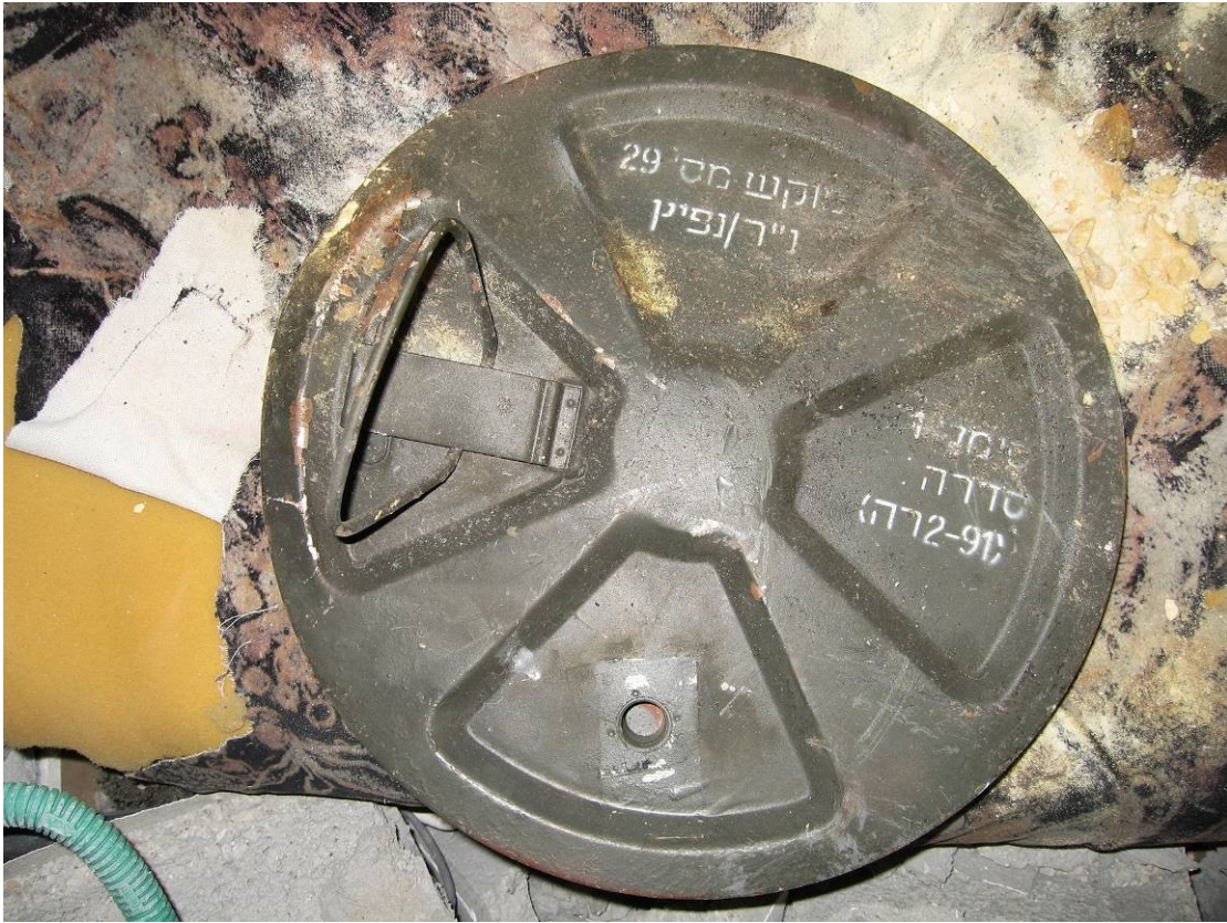
An Israeli anti-tank mine with Hebrew markings

On Wednesday 28 January, at the home of the Mardi family in Atatra, where 20 members of the family lived, Amnesty International delegates found one of the anti-tank mines that was used by Israeli soldiers to blow up the family's house on 4 January. The mine was damaged but had failed to explode. The family said that they had found another such mine, wholly unexploded, which had been removed by the local police. The mine, like others - exploded and unexploded - found by AI delegates in the rubble of other destroyed houses, bore Hebrew writing and serial numbers. Though designed for use against tanks, these mines are easily adapted to other purposes through the addition of an explosive charge and fuse. Israeli soldiers have previously confirmed to Amnesty International that these anti-tank mines have long been used to destroy Palestinian houses, most often in the West Bank but also in Gaza.