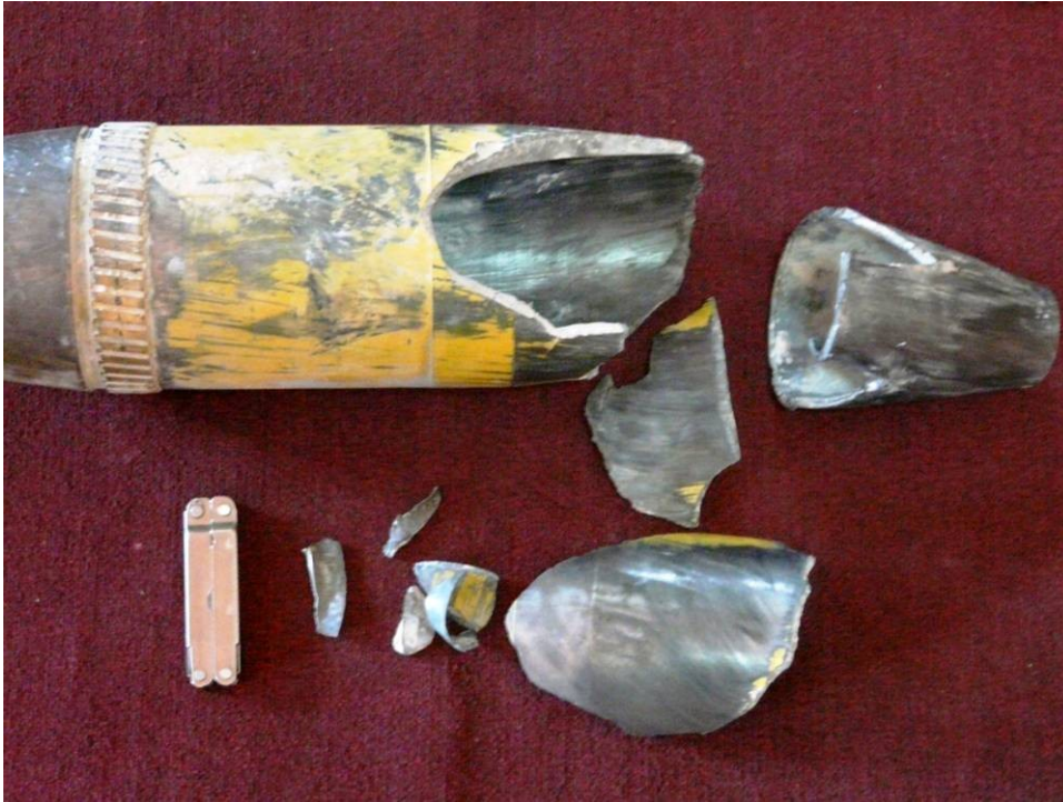
An artillery carrier shell which ejects a canister for illumination