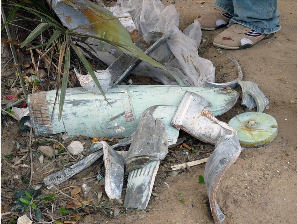
A white phosphorus carrier shell

Amnesty International found that the Israeli army used white phosphorus, a weapon with a highly incendiary effect, in densely-populated civilian residential areas in and around Gaza City, and in the north and south of the Gaza Strip. The organization's delegates found white phosphorus still burning in residential areas throughout Gaza days after the ceasefire came into effect on 18 January - that is, up to three weeks after the white phosphorus artillery shells had been fired by Israeli forces. Amnesty International considers that the repeated use of white phosphorus in this way in densely-populated civilian areas constitutes a form of indiscriminate attack, and amounts to a war crime. 3