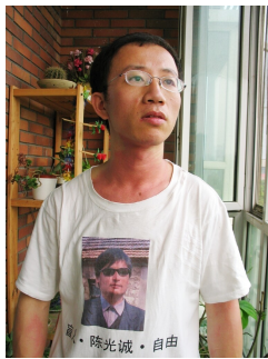
Hu Jia wearing a t-shirt supporting Chen Guangcheng (see below), July 2004.

The formal police detention of Hu Jia on 27 December 2007 illustrates broader patterns of repression of activists in China in the run-up to the Olympics. As detailed in previous Olympics Countdown reports, Hu Jia had been held under 'house arrest' or 'residential surveillance' for most of the time since he was released from a previous period of police detention on 28 March 2006. Police failed to provide formal documents clarifying the reasons for 'house arrest' and he was beaten on several occasions for trying to leave his home without permission. 14 Hu Jia had established numerous contacts with foreign journalists, embassy staff and other international figures and his formal detention just after Christmas appeared to be timed to minimise international publicity. The police formally charged him with 'inciting subversion' on 28 January 2008, an accusation which continues to be used regularly to silence and imprison peaceful activists in China.