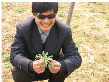
Human rights activist Chen Guangcheng was sentenced to four years and three months in prison.

As several of the above cases illustrate, a growing number of peaceful activists are being targeted for detention and prosecution on suspicion of committing state security offences such as 'revealing state secrets' or 'inciting subversion'. According to an analysis of China Law Yearbook data conducted by the US-based Dui Hua Foundation, the number of such cases handled by Chinese courts in 2006 increased by nearly 20 per cent compared with the previous year and arrests on state security charges rose to their highest level in eight years in 2007. 24 Amnesty International considers that the growing use of politically-motivated prosecutions against peaceful human rights defenders runs counter to official commitments to improve human rights in the run-up to the Olympics.