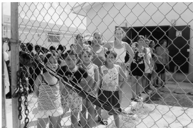
Children detained alongside female detainees line up for roll call ©Amnesty International.

Amnesty International is seriously concerned about the treatment of children detained in the Carmichael Detention Centre. In the organisation's view, their conditions of detention amount to cruel, inhuman and degrading treatment and places the Bahamas in serious breach of the UN Convention on the Rights of the Child. 1 Amnesty International is calling for urgent measures to be taken to improve this situation.