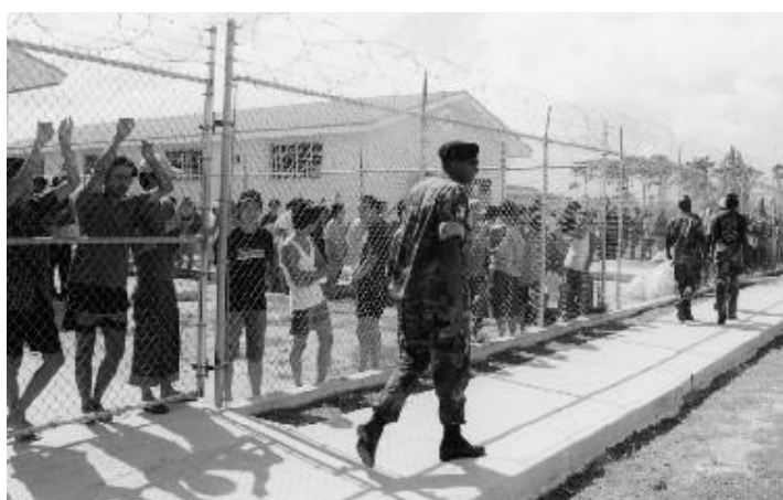
Soldiers patrol the inside of the Carmichael Detention Centre

Amnesty International is very concerned at reports that some detainees at the Carmichael Detention Centre have allegedly been victims of physical or, in some cases, sexual abuse whilst in detention. Amnesty International interviewed detainees extensively at the centre and believes that the reports received are credible. Reports of ill-treatment were brought to the attention of the authorities who thus far have failed to respond to requests for information on investigations.